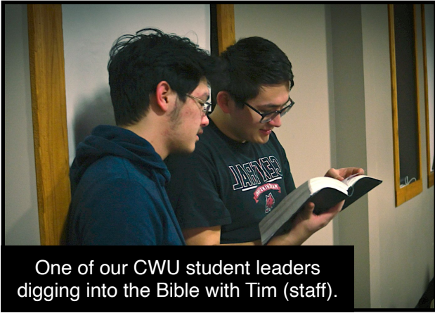
One of our CWU student leaders digging into the Bible with Tim (staff).