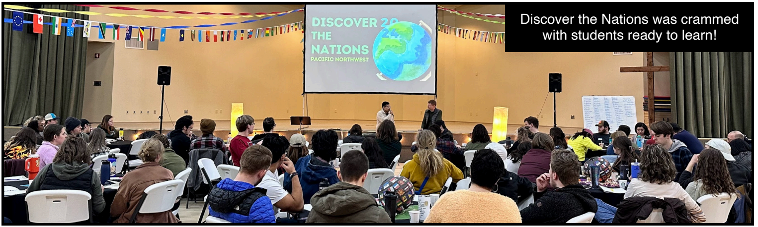
Discover the Nations was crammed with students ready to learn!