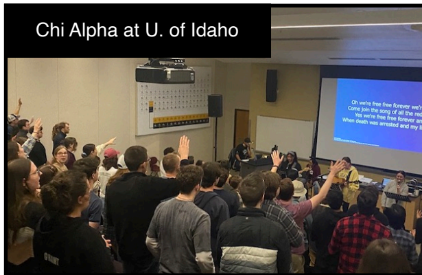
Chi Alpha at U. of Idaho