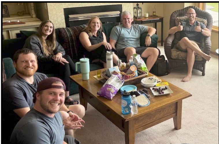
Chi Alpha Director team — Washington and N. Idaho