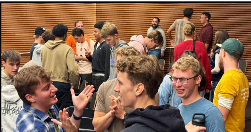
WWU Chi Alpha meeting — rockin' it in week 2

Super quick praise report: our Oregon State ministry is purchasing a new Chi Alpha house near the OSU campus, with the help of many churches in Oregon. Photos coming next time!